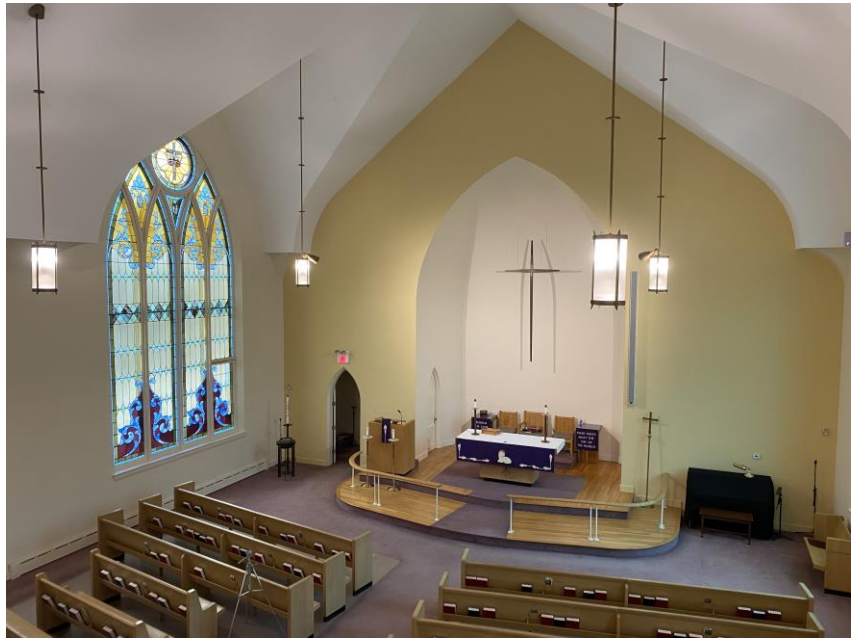
ABOVE: Exterior and interior views of Immanuel Lutheran Church, Evanston, IL.