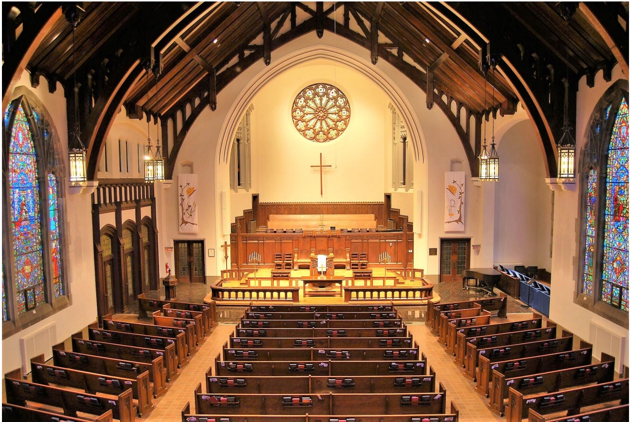
ABOVE: First United Methodist Church, Oak Park, IL; More information can be found on page 4-6 of this edition of The Stopt Diapason.

YouTube Channel: https://www.youtube.com/@cmwohs