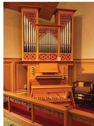
ABOVE left and middle: Casavant Frères, Op. 1130 in its original location at Saint James United Methodist Church on South Ellis Avenue in Chicago before the organ was moved to Saint John Cantius Church on North Carpenter Street in Chicago. ABOVE right: 1986 Karl Wilhelm Opus 106 formerly in Schmidt Chapel of Kenilworth Union Church, Kenilworth, IL.