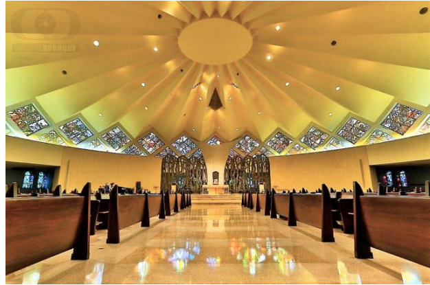
ABOVE left and right: Queen of the Rosary Chapel, Sinsinawa Mound, WI.